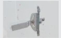
UPPER ADJUSTER HANDLES